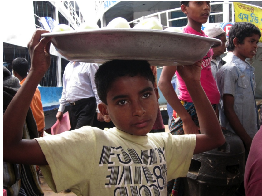
A boy selling food in the streets of Dhaka, Bangladesh