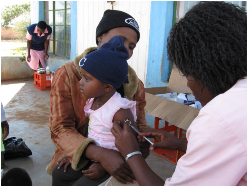
Health worker immunising a girl in Bulawayo, Zimbabwe